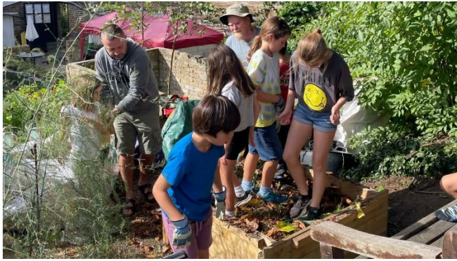
Our Little Growers learning about Paca Digestora

Four Duke of Edinburgh Award participants volunteered at the Garden during 2023. Initially three people, who were working towards bronze, and more recently someone working towards silver. All participants attended in accordance with our safeguarding policy requirements.